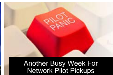
Another Busy Week For Network Pilot Pickups