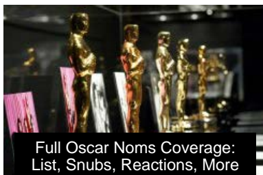
Full Oscar Noms Coverage: List, Snubs, Reactions, More