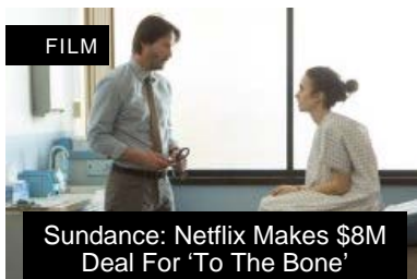
Sundance: Netflix Makes $8M Deal For 'To The Bone'