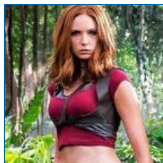
The Most Controversial Movie Costumes Explained