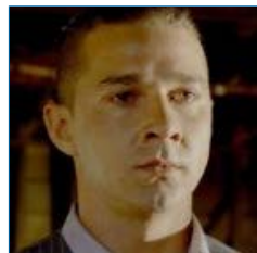
Actors Who Crossed The Line On Set