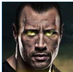
16 Upcoming DC Movies That Are Going To Blow Everyone Away