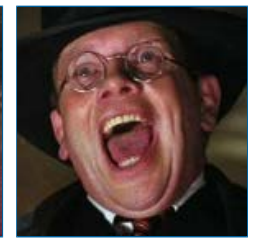
Movie Plot Holes That Weren't Actually Plot Holes