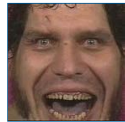
Pro Wrestling Debacles That Weren't Supposed to Happen