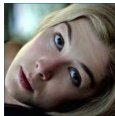
8 Most Uncomfortable Love Scenes Of All Time