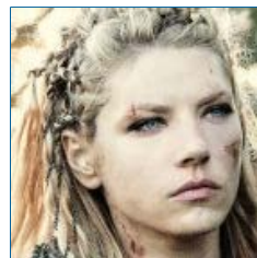
Why Lagertha From 'Vikings' Looks So Familiar