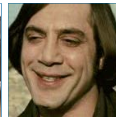
The Most Infuriating Movie Endings of All Time