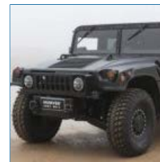
New Hummer H1 Goes On Sale Only in China