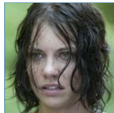
Scenes That Pushed Actors Way Too Far