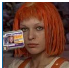
22 Things You Never Knew About 'The Fifth Element'